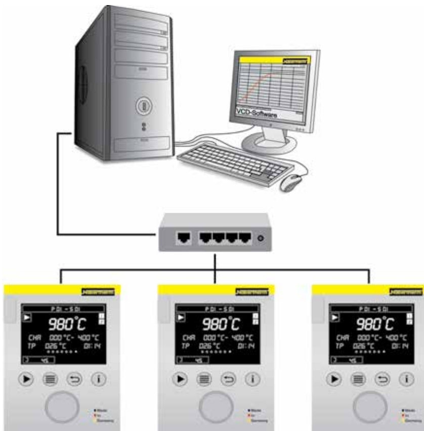
Example lay-out with 3 furnaces