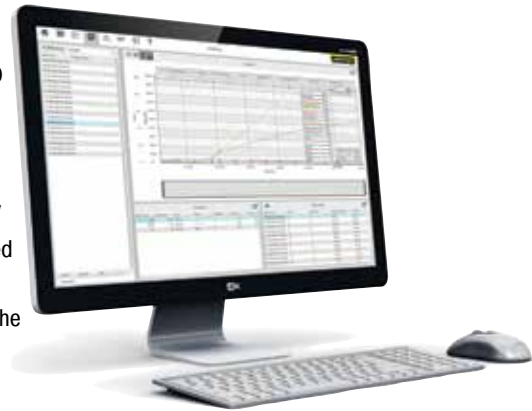
VCD Software for Control, Visualisation and Documentation

The VCD software is used to record process data from the controllers B400/B410, C440/C450 and P470/P480. Up to 400 different heat treatment programs can be stored. The controllers are started and stopped via the software. The process is documented and archived accordingly. The data display can be carried-out in a diagram or as data table. Even a transfer of process data to MS Excel (.csv format *) or the generation of reports in PDF format is possible.