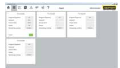
Graphic display of main overview (version with 4 furnaces)